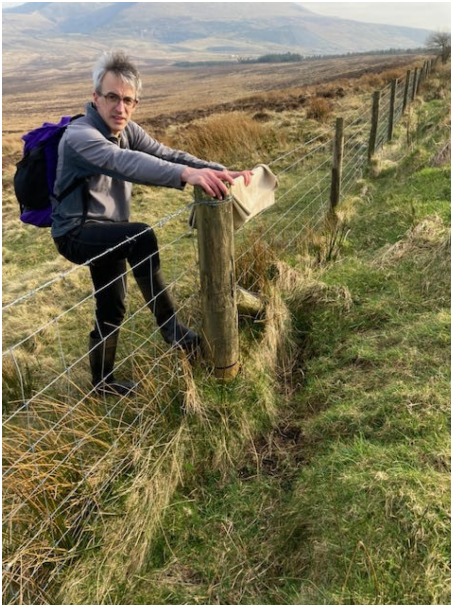
Preparing to exit the flying site – there is a step and grip tape both sides.